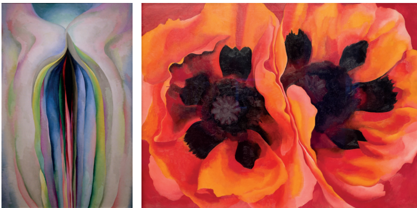
Work: Grey Line with Black, Blue and Yellow & Oriental Poppies .

Sadly, O'Keeffe's eyesight began to fail in her later years but she continued to create art by enlisting the help of several assistants. She died on March 6, 1986, aged 98.