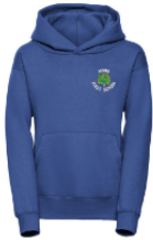
Acomb First School PE Hoodie